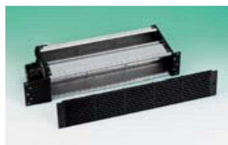
H = 88, W = 461, D = 175