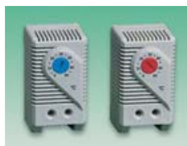
Normally open Normally closed H=60, W=33, D=35

Temp. adjustment range: 0-60°C Switching Capacity: 6A@250Vac (resistive load)